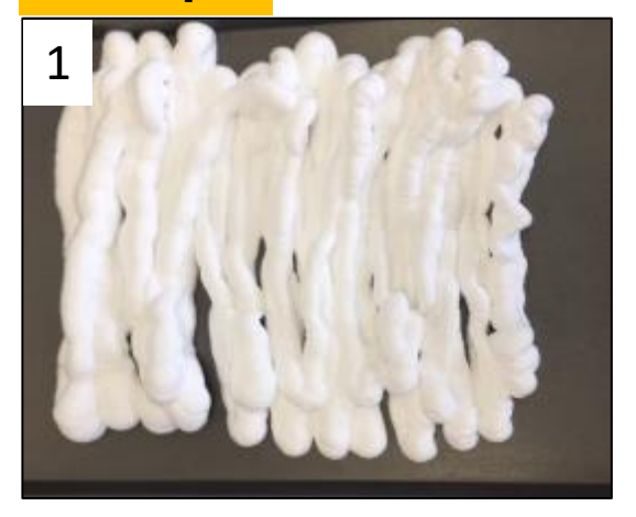
1. Spray shaving cream directly into a tray