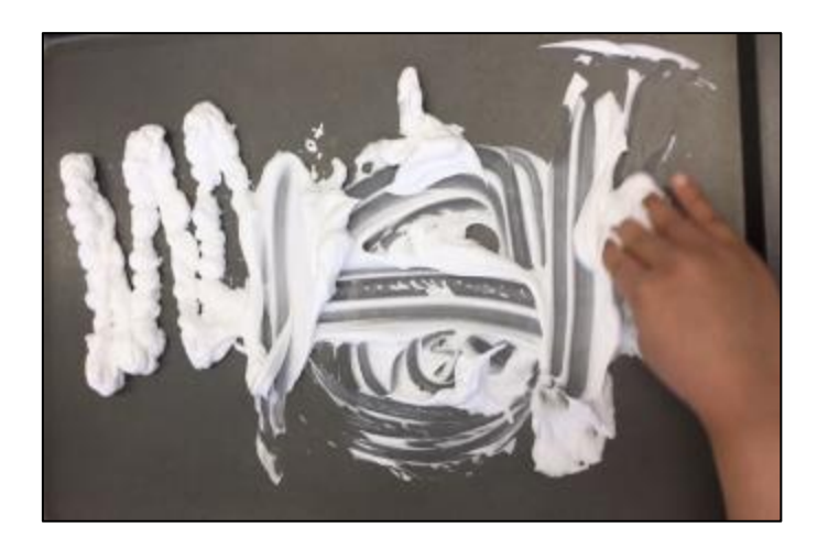
They can draw letters, shapes, pictures and even their names.