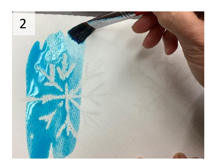
1, 2, 3. Draw some snowflakes using oil pastels. Paint over them using various paints.